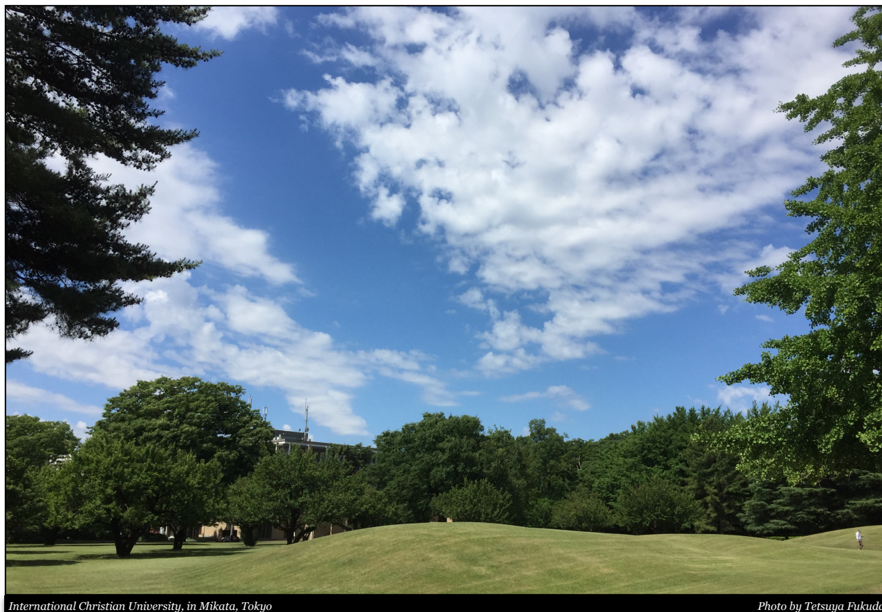
International Christian University, in Mikata, Tokyo

News and articles from the JALT College and University Educators Special Interest Group