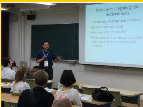
The CUE forum at PanSIG 2018.

The forum was well attended with around thirty participants who eagerly listened to the presentations, asked thought-provoking questions, and offered useful insights. Altogether,